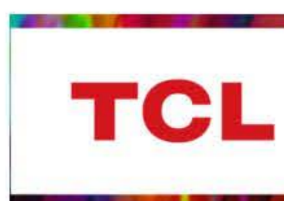
TCL India celebrates 6th anniversary with 'Dil Se Diwali' campaign