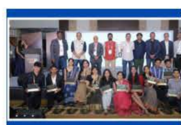
Dailyhunt, AMG Media Networks conclude #StoryForGlory talent hunt with 12 winners